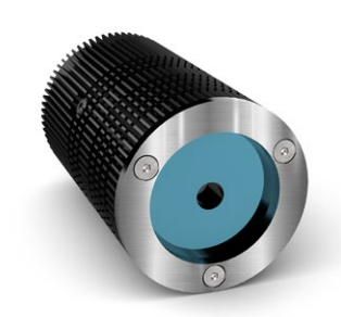
T060 ultra-compact sensor head

material. It also enables better monitoring of the stability and homogeneity of the coating and grinding processes. Due to the generally high similarity between this layer and the base cast-iron material, technologies relying on magnetic or conductive differences between the two materials cannot be used in the majority of cases. For the same reason, radiative techniques such as X-ray fluorescence cannot differentiate between the layer and the base substrate.